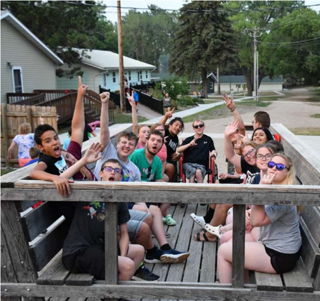
Campers of all abilities enjoy the hayride.