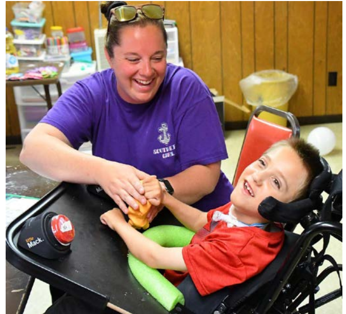
During a speech class, campers made Play-Doh and puffy paint while working on following step-by-step directions.

camp is completely funded by the North Dakota Elks and donations.