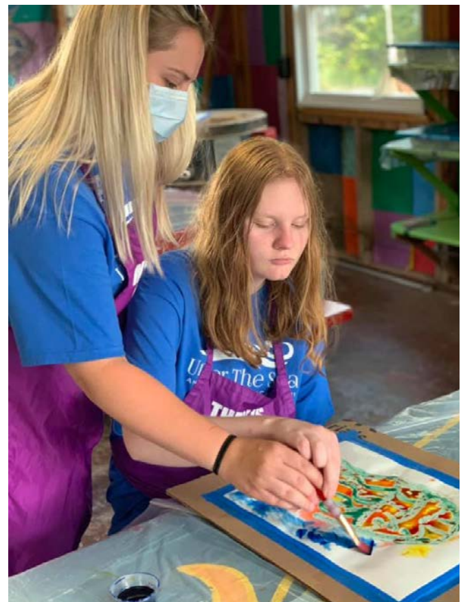
Campers enjoy an adaptive art project.

“With nearly 500 charities participating, there is an