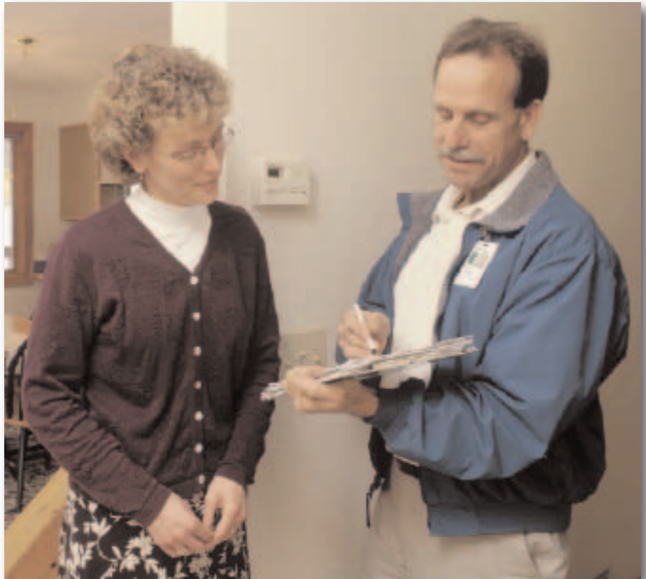
Talk to the energy experts at your local electric cooperative about the best heating solution for you.

Yes, a portable electric space heater may take the chill out of garages, basements or workshops. But using an electric space heater requires attention to safety as well as comfort.