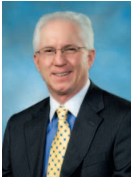
CUTLINE INFO TO FILL

We must communicate our positions with integrity and a strong sense of ethics, and remain steadfast in our commitment to that person at the end of the line. That should be easy; those are some of the basic principles upon which our cooperative program was founded.